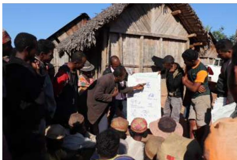
Gender Sharing and Negotiation Session of commitments made by men and women