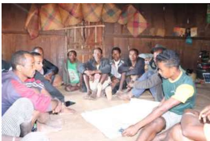
Focus group men/ young boys