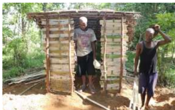
Men in action to support households to ease household chores and create latrines for the family