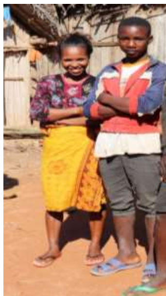
Voluntary couples ready to change social structures and rules through small actions jointly agreed between them.