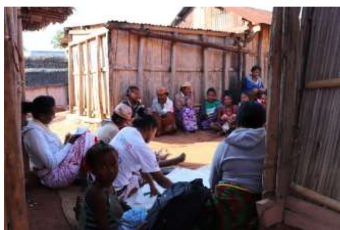
Focus group women/young girls