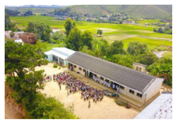
A WASH friendly primary school in the commune of Sabotsy Anjiro.