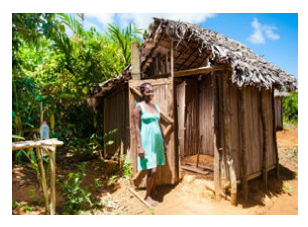
This woman living in Ambodicoco is proud of living in this clean village.

Having been known for its practice of open defecation, the village of Ambodicoco achieved open defecation-free village status only recently. A large number of the population had been suffering from chronic diarrhea, which pushed the village to mobilize. After reaching open defecation-free status, the village of Ambodicoco was ravaged by a fire that the population was unable to extinguish. In spite of this, the inhabitants did not give up and continue to respect the rules of hygiene in order to keep the population in good health.