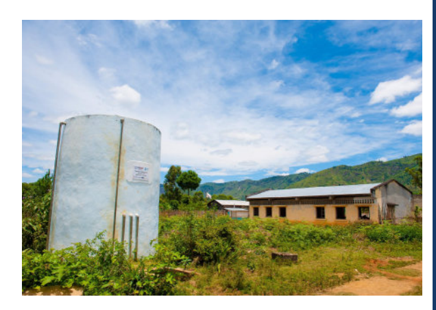
One of the water towers in the commune