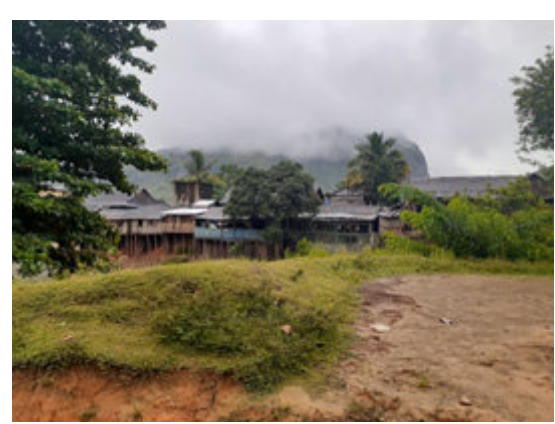
The municipality of Manapatrana

We are in Manapatrana, one of the municipalities of the Ikongo district in the Vatovavy Fitovinany region. This municipality is difficult to access with almost impassable roads. And yet, Manapatrana is a model in terms of hygiene. With some impressive stories of local promoters in this municipality, hope is born among the population who refuse to sink into traditions that are obsolete.