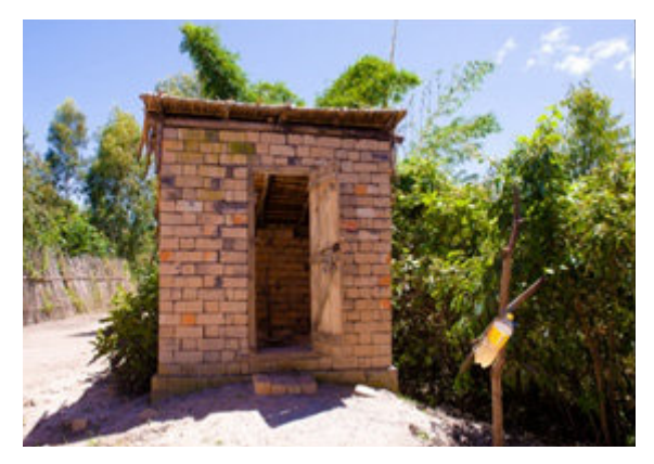
Latrine built by the inhabitants of Ambohimilamina