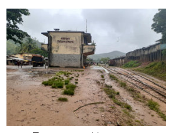
Train station in Manapatrana

We are in Manapatrana, one of the municipalities of the Ikongo district in the Vatovavy Fitovinany region. This municipality is difficult to access with almost impassable roads. And yet, Manapatrana is a model in terms of hygiene. With some impressive stories of local promoters in this municipality, hope is born among the population who refuse to sink into traditions that are obsolete.