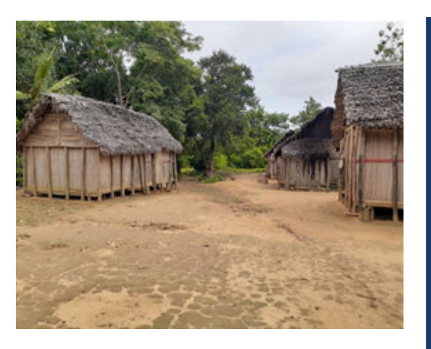
The clean village of Vohidravy