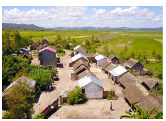
The calm and cleanliness of the village

In the Alaotra Mangoro region of Amparafaravola district, a small village called Ambohimilamina is home to twelve households. Two years ago, the inhabitants used to go into the forest to relieve themselves. Today, the inhabitants, equipped with shovels and garbage bags, take to the village street for sanitation work every week, an initiative to sensitize the villagers to respect the rules of hygiene. Village courtyards and even latrines are visited regularly by sanitation workers.