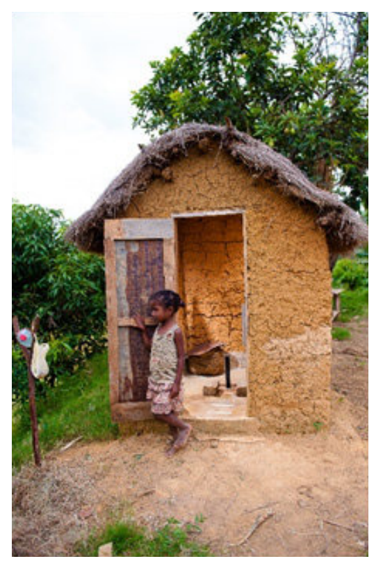
One of the fly-free latrines in Ambohimiarivo

In the commune of Ambohimiarivo, in the hamlet of Ambohimena, the inhabitants have not always been aware of the benefits of cleanliness. However, mobilized by the RANO WASH project, the community has constructed their own latrines, although they do not always use them. Technicians from the RANO WASH team faced a great dilemma because the stubborn population chose not to use the latrines.