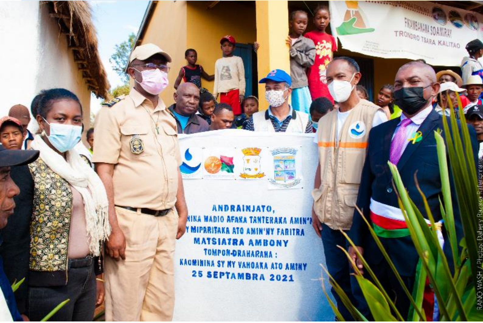
Technical agent in charge of WASH at communal level