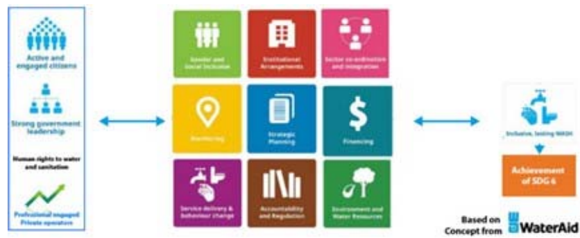
Figure 2: Building blocks for a strong WASH system